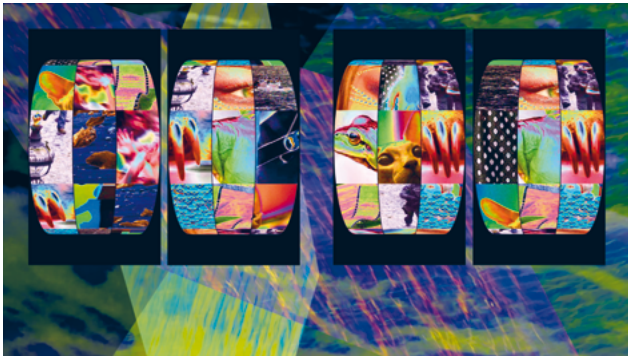
Tracking Pattern (2017) Katriona Beales

the edges of an embedded screen. A video installation, reminiscent of a fruit machine, displays a drum of hypnotically spinning images whose rotation is triggered by the movement of gallery visitors. Beales recreates