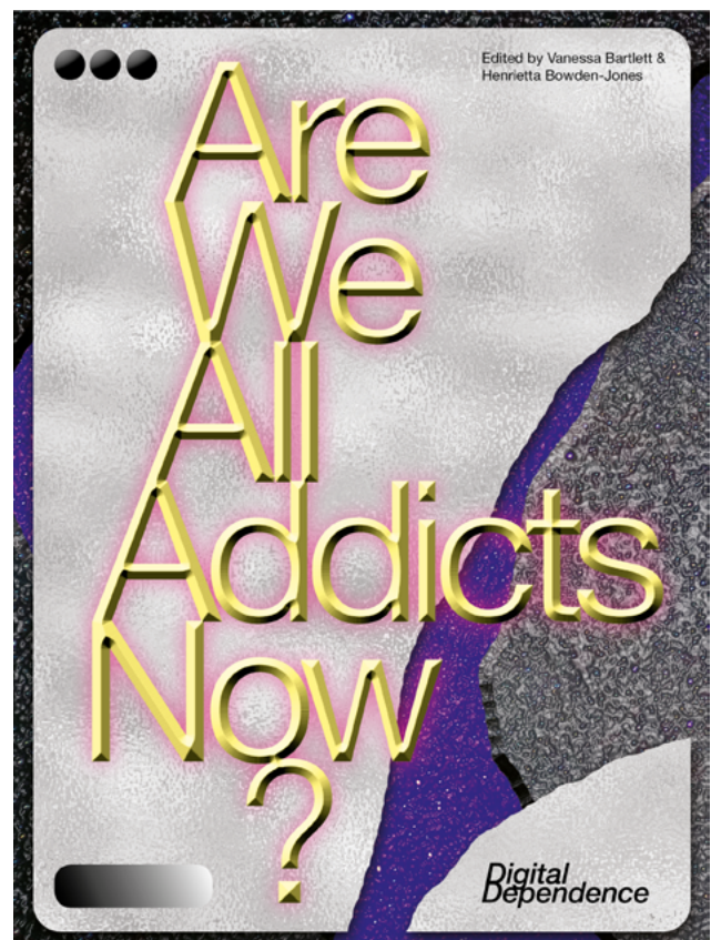
Are We All Addicts Now? book cover (2017) Stefan Schafer

liverpooluniversitypress.co.uk/products/100809